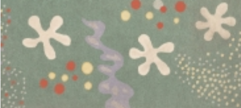
Top left: John Deere rug (detail), a-carpet; Top right: Carpet 1 (detail), Josef Frank, courtesy Svenskt Tenn; Below: Carpet 4 (detail), Josef Frank, courtesy Svenskt Tenn

NB: We do not accept film for any adverts